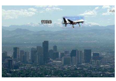
Mystery object nearly causes mid-air < < collision